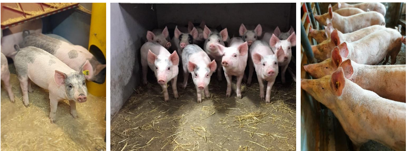
Figure 1: Growing finishing pigs: Photos: Magdalena Presto Åkerfeldt, SLU