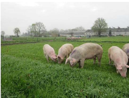
Sows before accessing a new paddock.