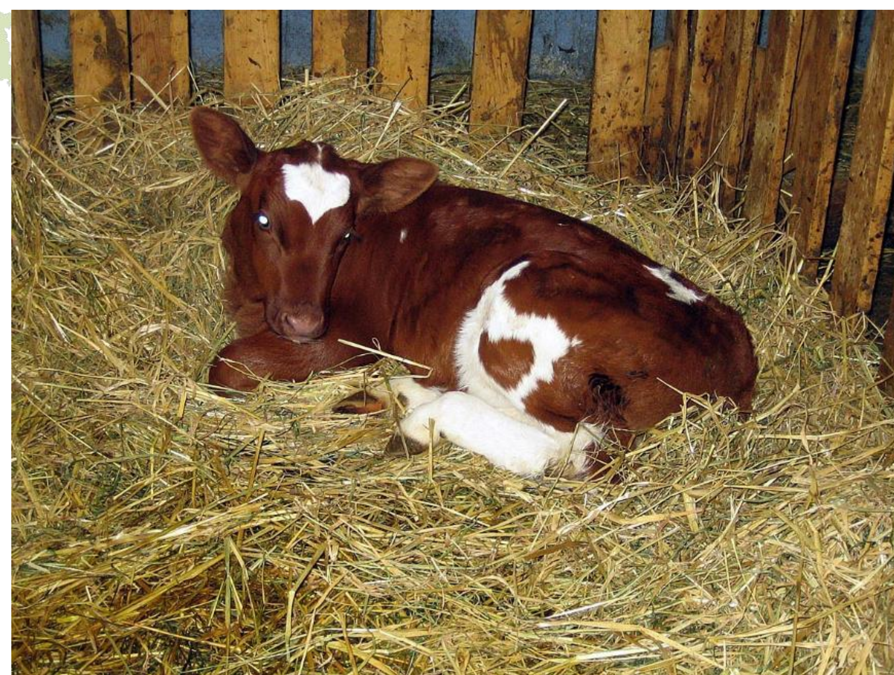
Figure 4. Nicely bedded organic calf. However, conventional straw may contain residues of growth regulators to shorten the straw, as well as glyphosate and other pesticides.

WP LIVESTOCK studies the use of natural plant sources of vitamins, and novel bedding materials in place of straw from conventional farms, such as agroforestry products. Natural anti-infective and immune-stimulating molecules are studied as alternatives to antibiotics and anthelmintic drugs.