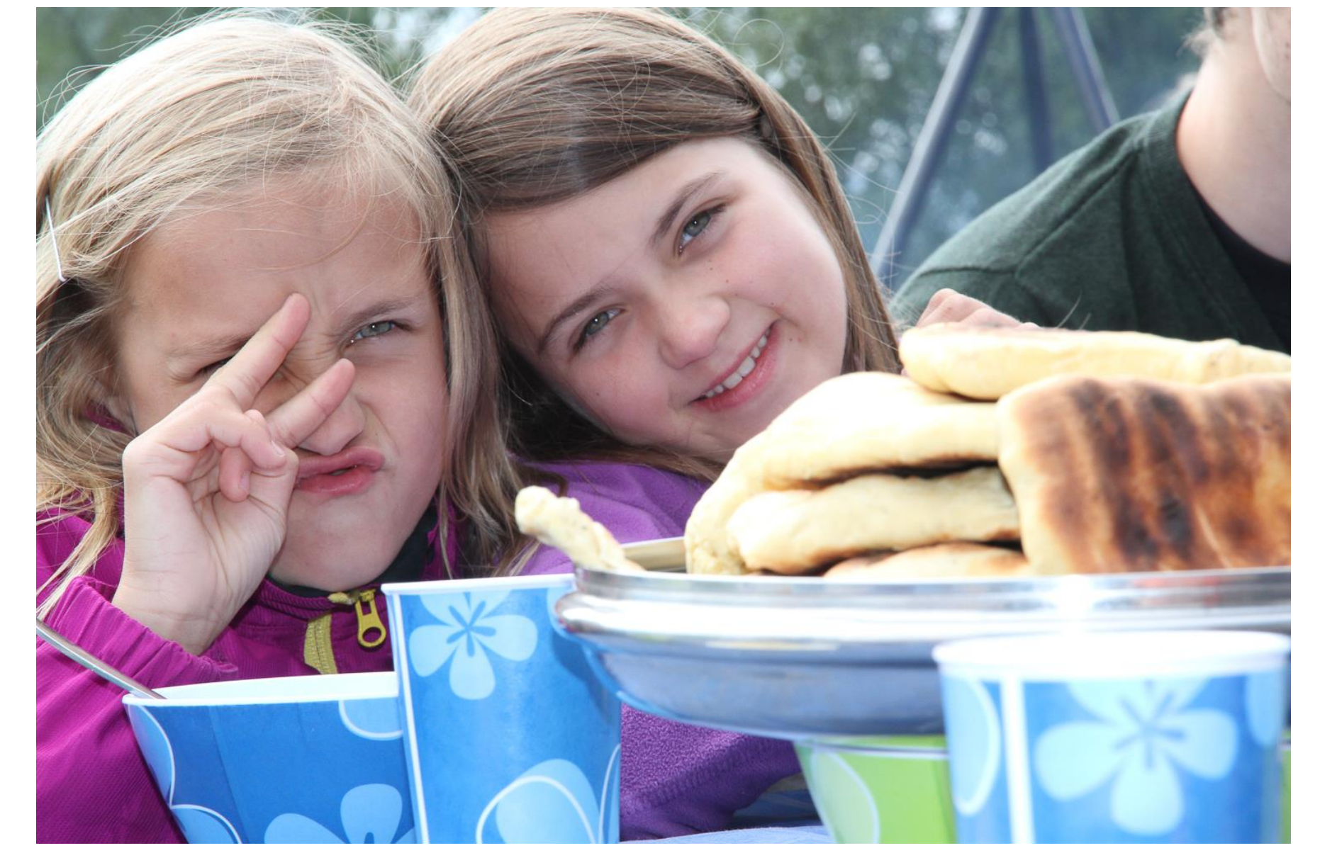
Figure 6. Future consumers – what do they expect, and what will they accept from organic production methods?

Consumers' perceptions are crucial for the market development of organic products. WP IMPACT studies consumers' attitudes towards existing inputs and relevant alternatives, to ensure they are in line with their expectations as well as with organic principles.