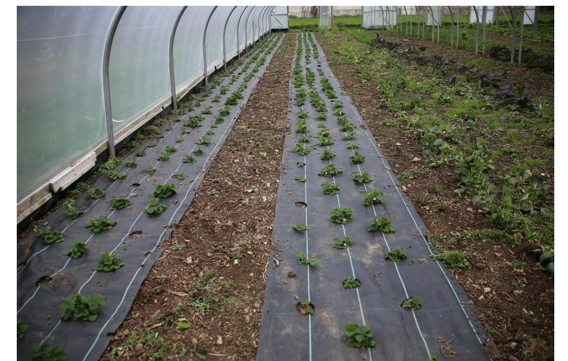
Figure 7. Plastic is a useful tool for soil covering. Completely degradable plastic from renewable resources is required, but the cover also has to last long enough to fulfill the purpose. Can we add biochar as a filler in the plastic cover?

WP MODEL integrates results from all WPs to produce scenarios for the phasing out of contentious inputs. Sustainability evaluations will be made by life cycle assessment tools.