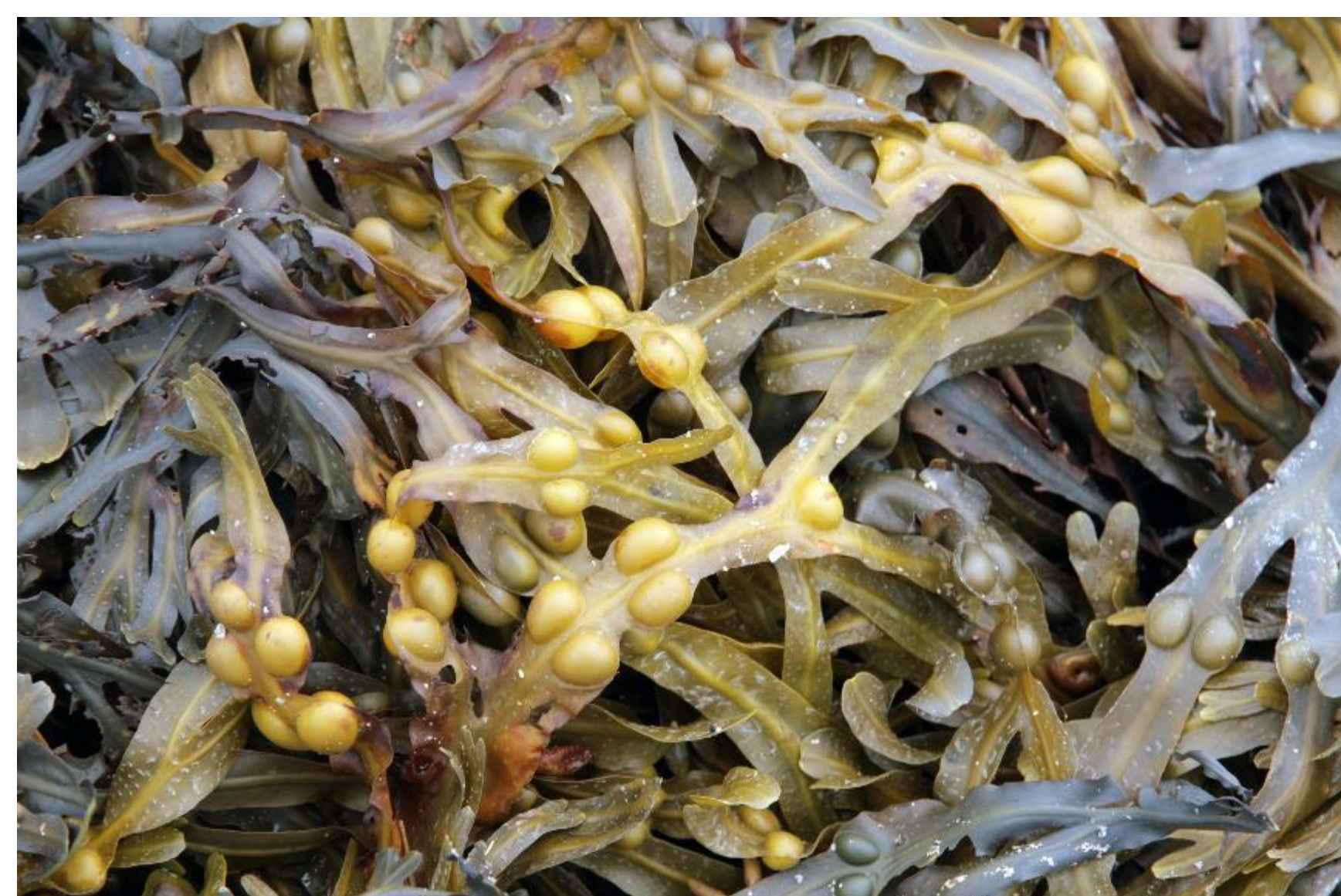
Figure 5. Seaweeds contain a multitude of nutrients: the new organic fertiliser?

WP SOIL researches alternatives to manure from non-organic farms and other animal-derived fertility inputs, such as blood- and bone meal. Legume-based and marine-derived fertilisers, as well as pond sediments from organic fish farming will be studied. Peat in growing media may be replaced by processed materials from agroforestry and cuttings from perennial crops. Degradable plastics and biocomposites may replace fossil fuel-derived plastic for weed suppression.