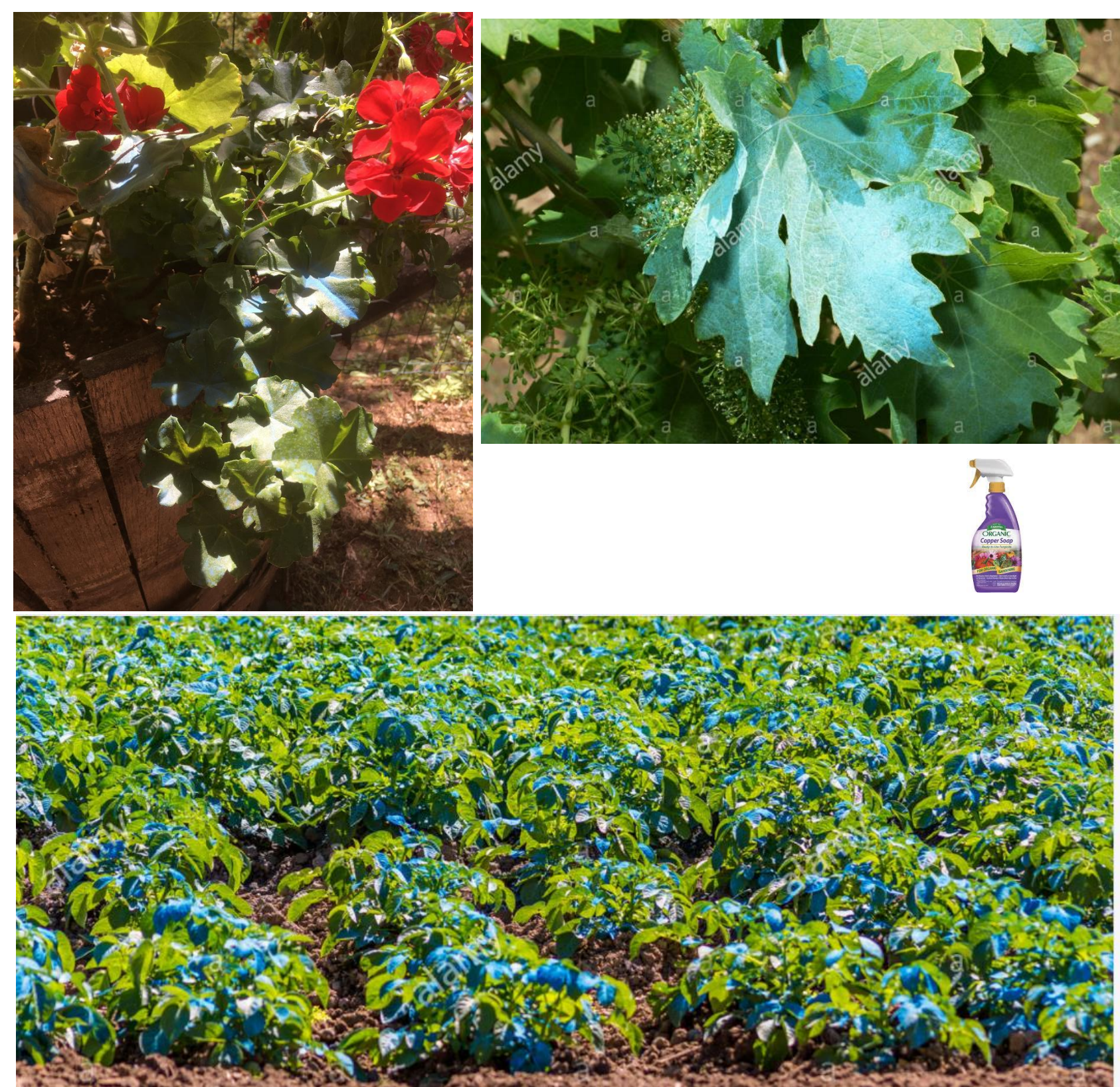
Figure 2. Copper salts (blue powder) protects plants against fungal disease. Significant amounts are used in organic agriculture in Europe, with toxic effects on the environment and accumulation in soil.

All experimental work will be conducted in multiple European countries in close collaboration with relevant stakeholders including product manufacturers and commercial farmers and growers.