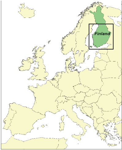
Fig. 2. The area for the cereal leaf spot disease survey conducted in Finland.