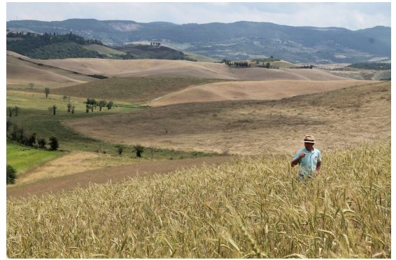
Figure 1: View of a FURAT field in the organic farm Floriddia (2023, Tuscany, Italy).

Communication: development of a publication for explaining the importance of organic breeding, agrobiodiversity and OHM to consumers