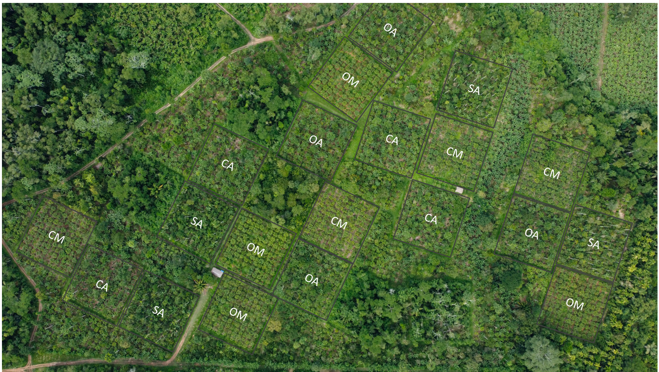
Fig. 1. Drone image of the field site investigating cocoa production systems. CM - conventional monoculture; OM - organic monoculture; CA - conventional agroforestry; OA - organic agroforestry; SA- successional agroforestry.