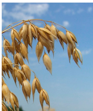
Figure 4: Common oats with few seeds in each spike

The top of the oat consists of small branches. Each spikelet contains 1-3 flowers, each of which can develop a kernel. Oats prioritise the outer grain in each spikelet first, which is therefore always the largest, and only if there is enough nutrients will the second or third grain develop. In cultivated oat species, 2-3 kernels usually develop in each axis, but the number can depend on the variety and growing conditions. In some wild oat species, there is a loosening layer over the outer grains, making the entire axis act as a dispersal unit, similar to what is seen in spelt and emmer, for example. In cultivated oat species, the loosening layer is located between the individual flowers in the minor axis. In this way, the grains are separated during threshing.