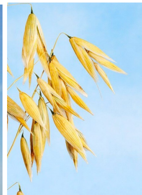
Figure 3: Naked oats with multiple seeds in each spike

The core is enclosed by a bract and a bracteole. The bract is the largest, and on it is a larger or smaller stalk, which may be slightly squat. On wild oat species that often appear as weeds, such as wild oats and wild oats, the stack is strongly squat and is spirally twisted under the squat. As the kernel falls to the ground and absorbs moisture, the stack unravels, acting like a drill that drills the seed into the soil. At the root of the stack are bristles that act as barbs when the seed is drilled into the ground.