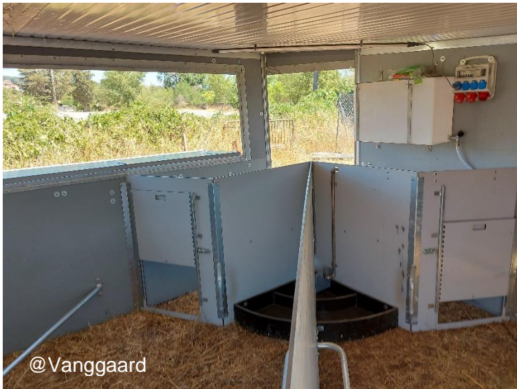
Picture 2: Inside view of farrowing hut for two sows, with entrance door for farmer in the back and upside wall part opened for ventilation on the left, with water and feed trough on the ground beside piglet cave with heat lamp, and with steel hoops/anti-crushing bars on the walls to minimize piglet mortality and help the sow to lie down.