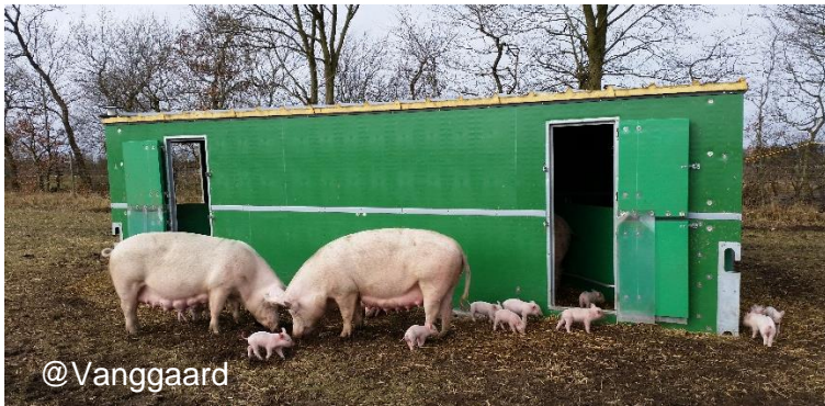
Picture 1: Outside view of a farrowing hut for four sows.