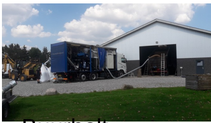
Buurholt Mobile seed cleaning and milling