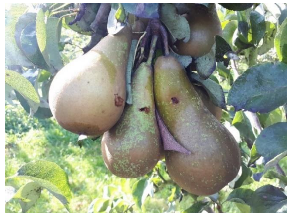
Picture 1. Damage by codling moths at harvest of Conference pears on 7 September 2020. One larva ruined three pears.

All practices should be combined to achieve the best result