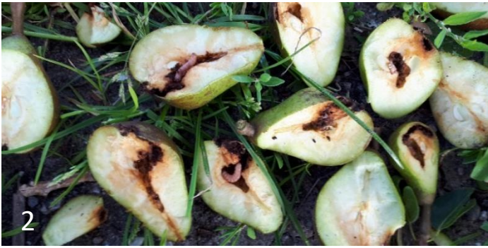
Picture 2. Penetration of codling moth in young fruits of the Pierre Corneille variety on 19 July 2021. Pierre Corneille is highly susceptible to codling moth. The larval stage in fruit is the last larval stage.