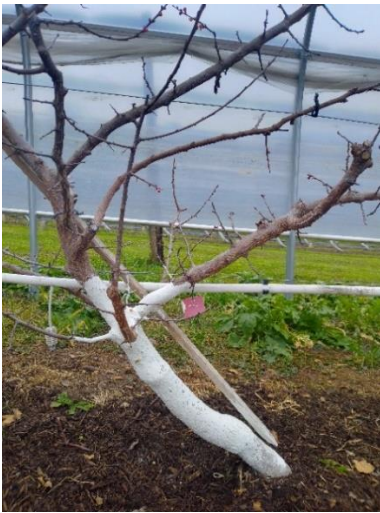
Picture 2. Apricot tree with interstem ( Prunus domestica subsp. italica ) grown in a plastic tunnel, experimental planting in Frick, FiBL, the tree's trunk is whitened as protection against bark cracks.