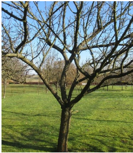
Picture 3. Rootstock myrobalan, interstem plum variety Stanley, apricot variety Karola in 15 th growing year, tree in very good health condition.