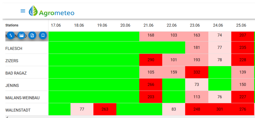
Figure 2: Graph of the Agrometeo output to indicate risk of downy mildew infections. Risk is indicated with numbers based on model calculations and colours (green = no risk, light pink = low risk, dark pink = intermediate risk, dark red = high risk)