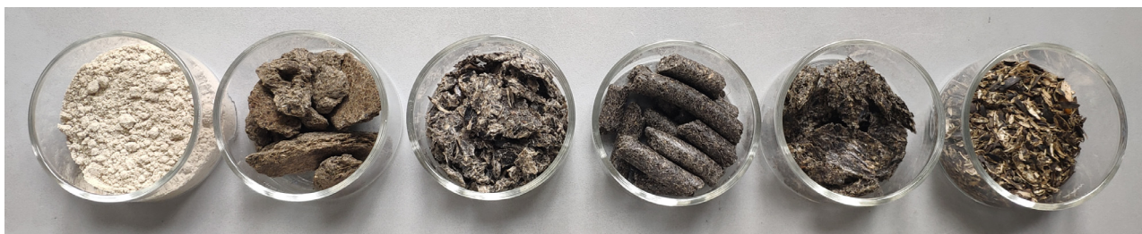
Fig. 1. Different sunflower press cakes (from left to right: from fully dehulled seeds; from 90% dehulled seeds; from 70% dehulled seeds; from whole seeds; hot pressed from whole seeds; hot pressed from whole seeds and extracted with hexane).

where the whey is often downcycled to animal feed or biogas, especially in geographically remote regions. This underlines the strong need for holistic approaches and integrated solutions for whey utilization (Lappa et al., 2019).