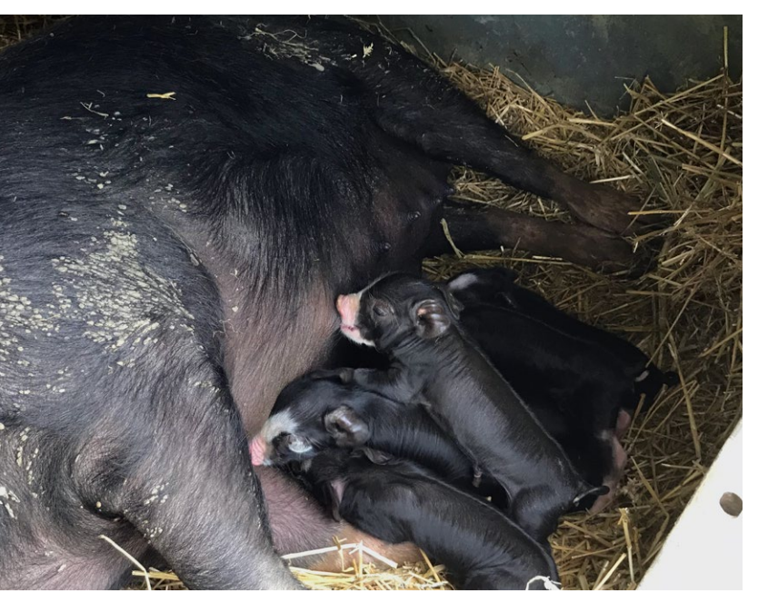
This farm's robust sow breed also farrows outside in winter with the protection of the huts.