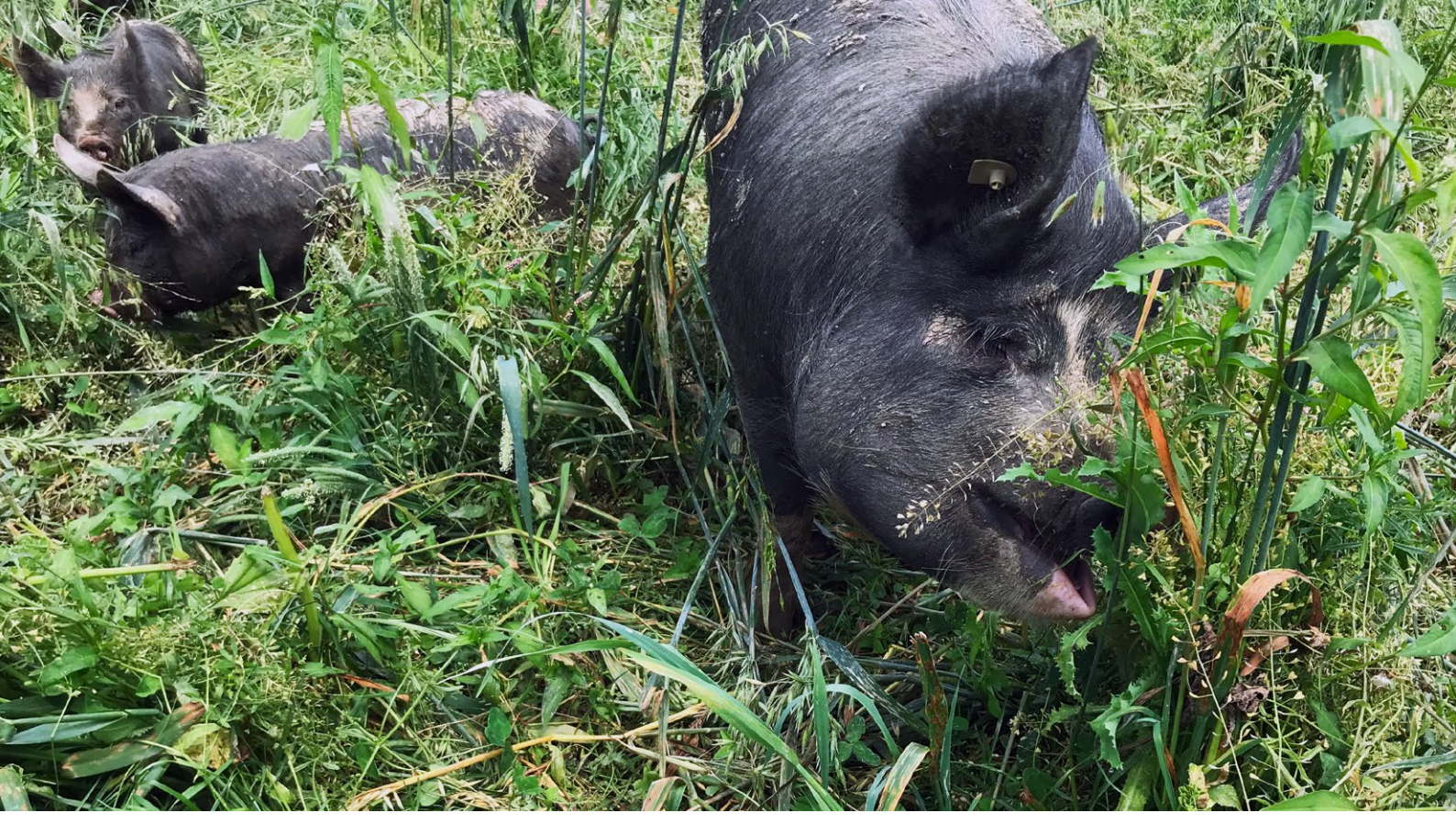
To enrich the sows' and piglets' diets, the farmer sows rye into the pasture.