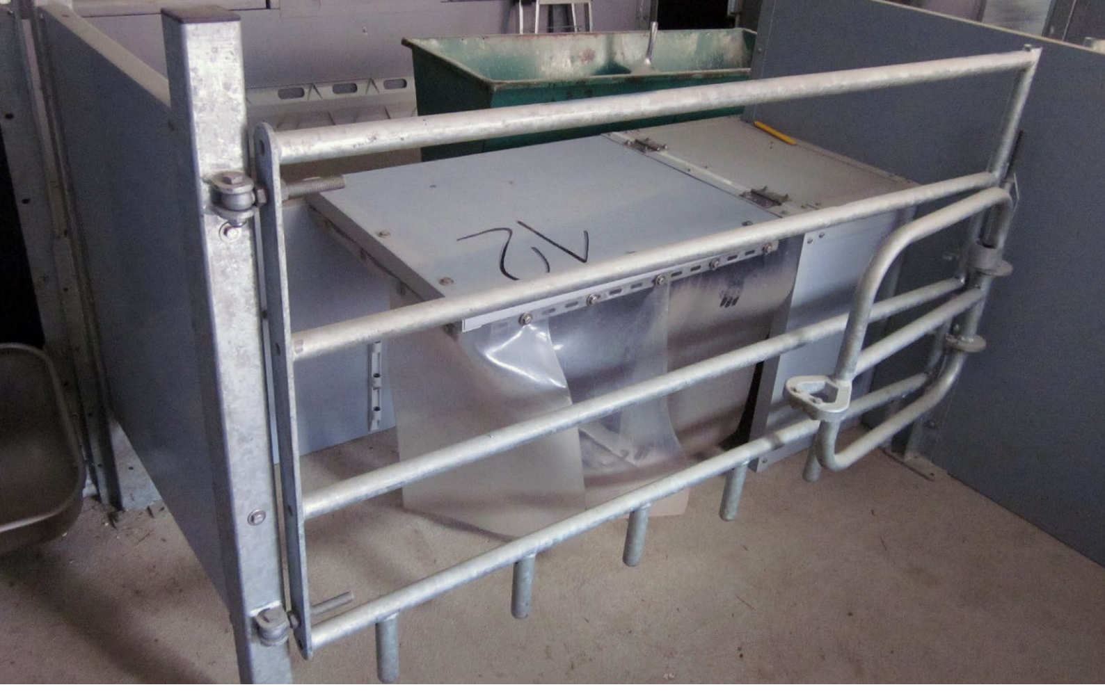
A piglet nest made of plastic and metal can be cleaned especially well.