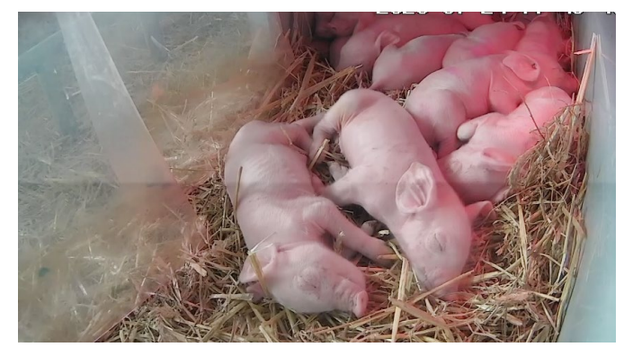
A heated, bedded and insulated piglet nest provides a suitable resting area for suckling piglets.

cies-specific behaviour. Piglet losses can still occur because free farrowing can be associated with an increased risk of piglets being kicked or crushed by the sow. Due to both ethical and economic considerations, one of the aims of organic pig husbandry is to reduce piglet losses as much as possible. Early and frequent use of the piglet nest can improve piglet survival because it reduces the risk of cooling and being kicked or crushed by the sow.