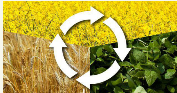
Fig. 1: Scheme of rotation. Crops of the different botanical families are grown alternately.

plants. In the following paragraphs you learn how to do that, with examples of good crop rotations.