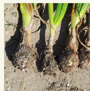
Figure 2. Damage to crops by pests and diseases: a) Fusarium in onion (middle onion plant), b) Verticillium in strawberry, c) Rhizoctonia solani in lettuce, d) Sclerotium cepivorum in onion.