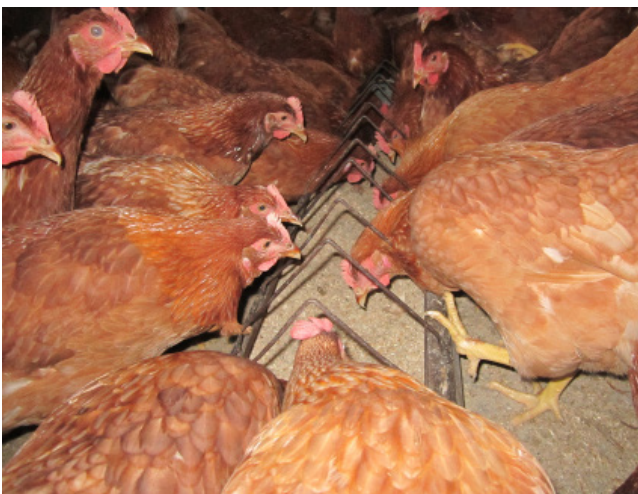
Laying hen.

This note provides an insight into successful farm practices and feed rations with field peas in organic farming.