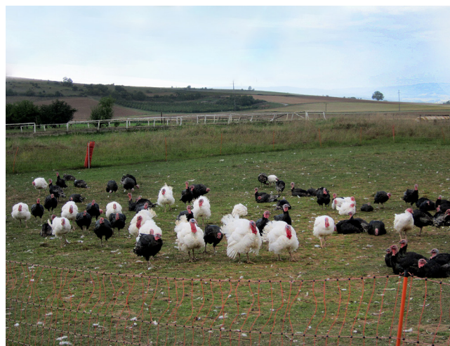
Turkeys on open pasture.

The turkeys receive a complete feed in the first stages of life to give them the best start. Turkey chicks are the most demanding of all poultry species in terms of feeding. In the later growing