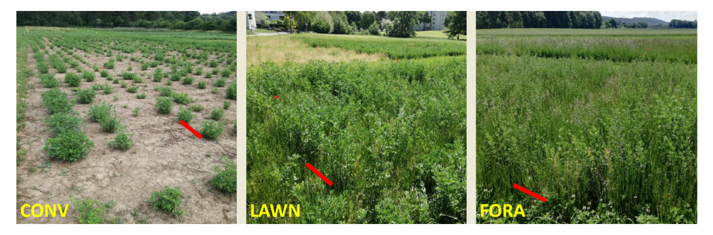
Figure 1. Spaced alfalfa plants in the CONV (bare soil), LAWN (sward with lawn-type grasses), and FORA (sward with forage-type grasses) cultivation systems during the first growth of the second year. Red scale bars indicate the planting distance within rows of 45 cm.

For each of the 50 accessions, 30 plants were grown per cultivation system, resulting in 4500 spaced plants in total. Plants of the CONV cultivation system were grown on a conventionally managed field and plants of the LAWN and FORA cultivation systems on an adjacent organically managed field. A typical breeding nursery design was used, with ten alfalfa plants of the same accession being planted in a row. Planting distance was 45 cm within and 50 cm between rows. On the conventionally managed field, three blocks of 50 rows (1 row per accession) were formed, all of them receiving the CONV treatment. On the organically managed field, six blocks of 50 rows were formed, alternately receiving the LAWN and the FORA treatments. This resulted in a split-plot like design with blocks