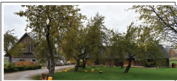
13. Organic farm “Ķeveiti”