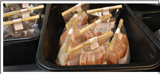
3. Organic linden flower and rye bread jellies