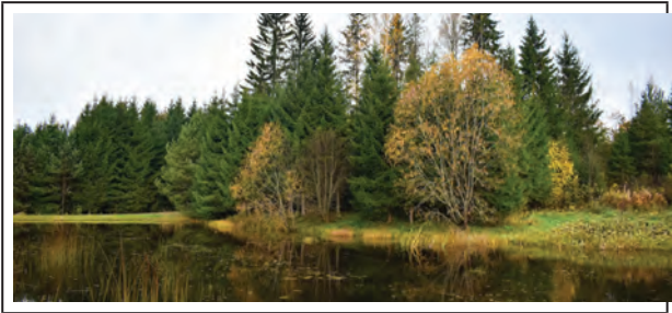
1. Beautiful landscape of farm “Indrāni”