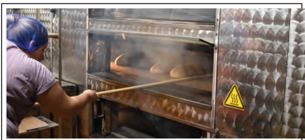
11. Loaf baking in very high temperature