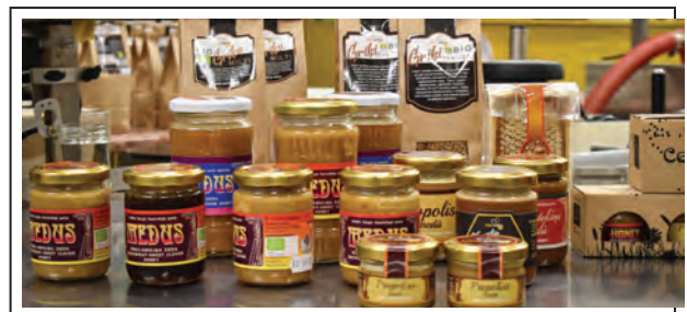
6. Organic products from “Kalna Smīdes”