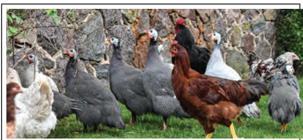
15. Organic chicken and guinea fowl