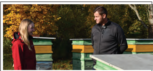
5. Organic bee swarm winter location