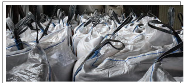
8. Organic wheat stock in companies’ warehouse