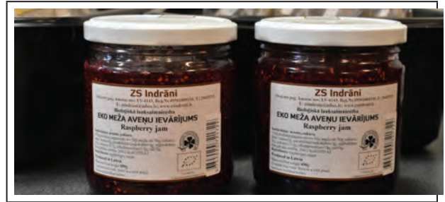
2. Organic raspberry jam