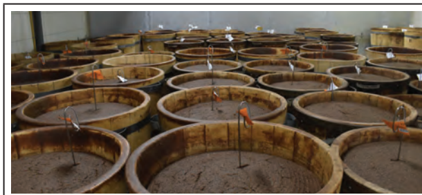
10. Scald making in wooden bowls