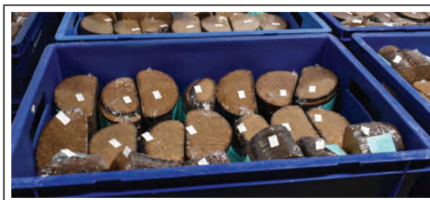
12. Freshly baked bread, cut and packed