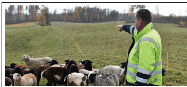
16. Sheep flock at meadow’ hillside