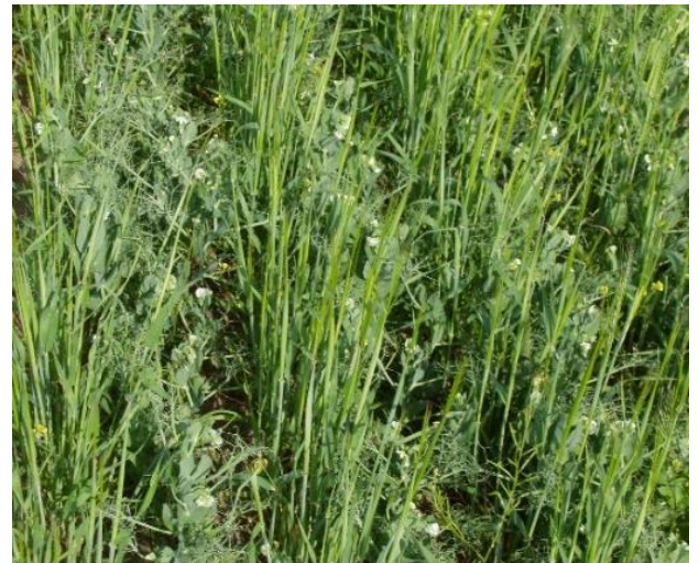
Photo 1 Alternate row intercropping of spring pea and barley.