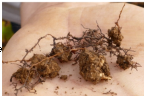
Grapevine roots sampled in France

Biovine partners sampled cover crops and grapevine roots (Fig. below) at different stages of grapevine development. Cover crop root system was carefully dug out from the soil to keep it intact, washed, and stored in plastic bags at 4 °C until DNA is extracted. In 2020, root colonization of 39 cover crops and 22 grapevine root samples was estimated. DNA from all samples was extracted and AMF diversity was assessed by sequencing a fragment of the large ribosomal sub-unit.