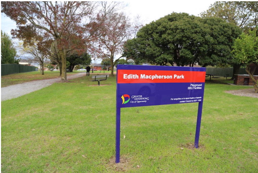
Image 1: Edith Macpherson Park (new signage installed in 2018).