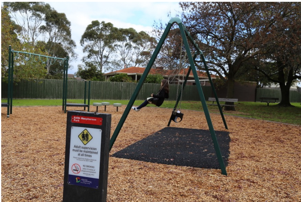
Image 2. The playground of Edith Macpherson Park is on the site of the original house.