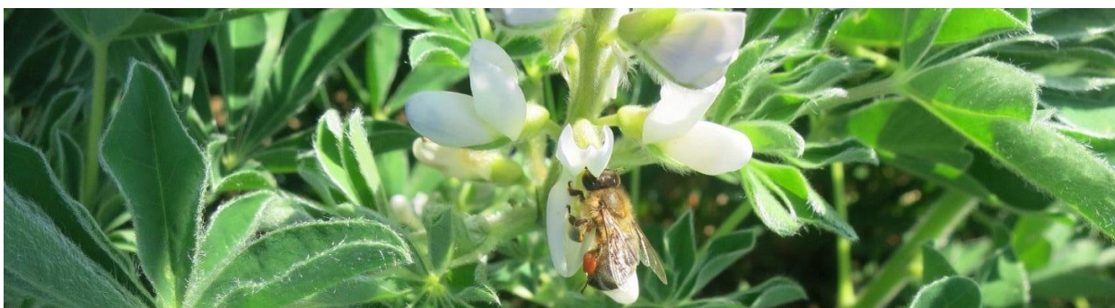
Fig. 5: besides bumblebees, honey bees regularly visit lupin fields, loaded with pollen pellets.