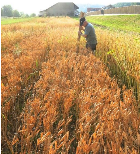
Fig. 6: a ripe field trial with white lupins in 2015

These questions are subject of our lupin trials. As no extensive lupin trials have been run before in Switzerland, we will have to refer to our own results once we can rely on several years' experience. This will be done in the final report of the DIVERSIFOOD project.