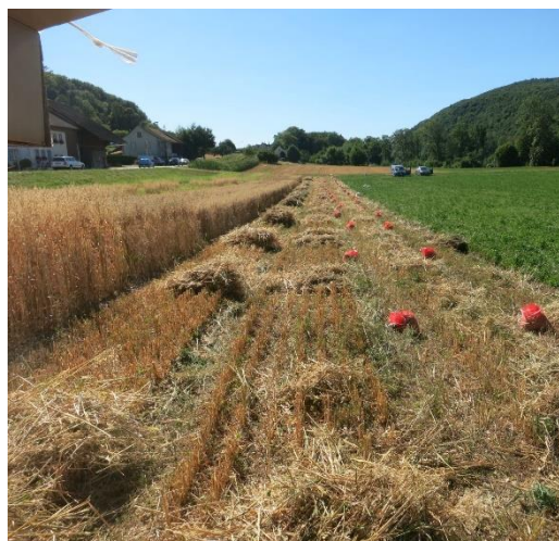
Fig.7: harvesting the white lupins in 2015: how much weeds can be seen?