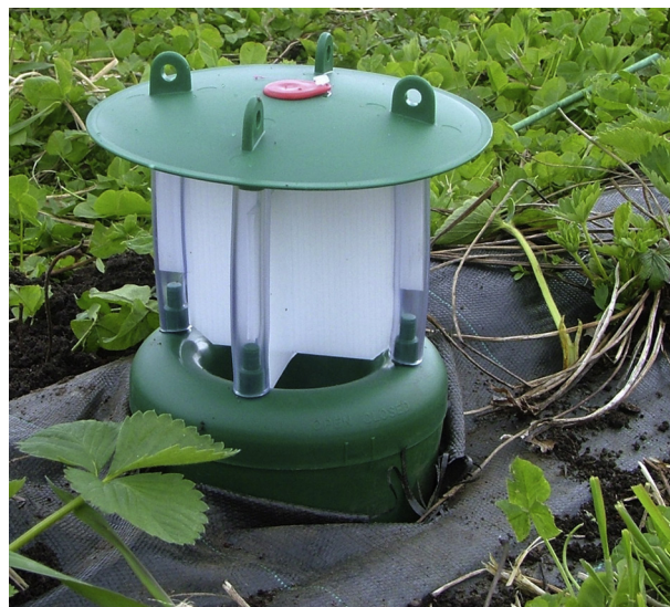
Fig. 1. Insect funnel trap from AgriSense – BCS Limited modified with 10 cm tall Correx white cross vanes. The traps were baited with strawberry blossom weevil aggregation pheromone sachets and/or host plant volatiles dispensers.

For plant volatile 1 (PV1), germacrene D (100% (-)-enantiomer, 80% GC-pure including \beta -caryophyllene and E,E- \alpha -farnesene distillation fraction of citrus oil from R C Treatt Ltd, Northern Way, Bury St Edmunds, Suffolk, IP32 6NL, UK), polyethylene vials (35 mm