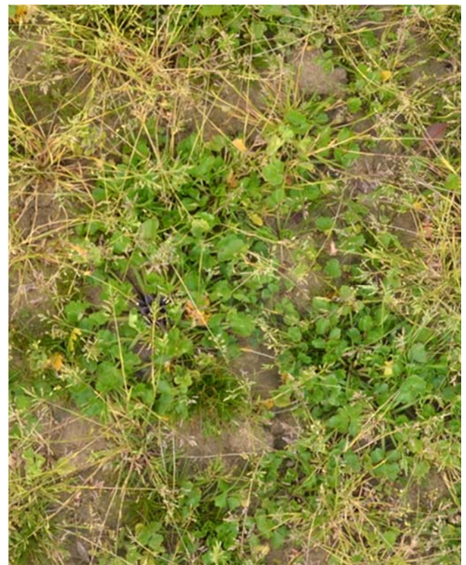
Wet soil showing a high presence of Poa annua and Ranunculus repens .