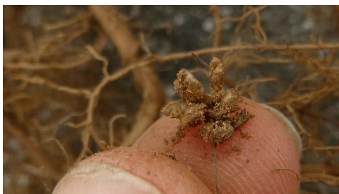
Brown or "empty" nodules from red clover ( Trifolium pratense ).