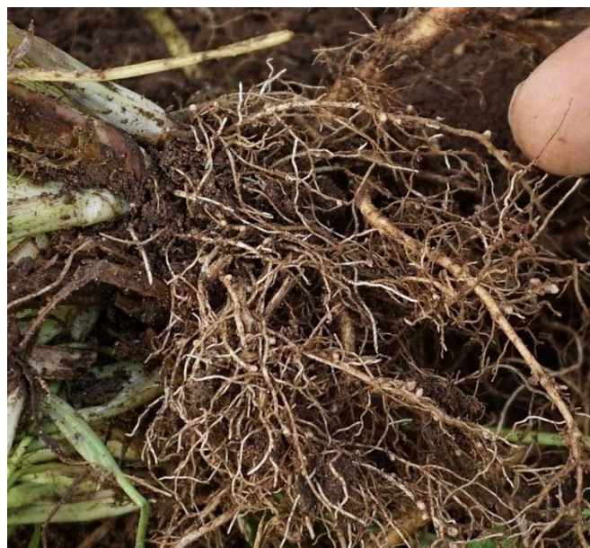
Searching for root nodules in a clover ley, Norway. We found nodules and active nitrogen-fixating bacteria on some of the red clover roots (Photo: S. Hansen, NORSØK).