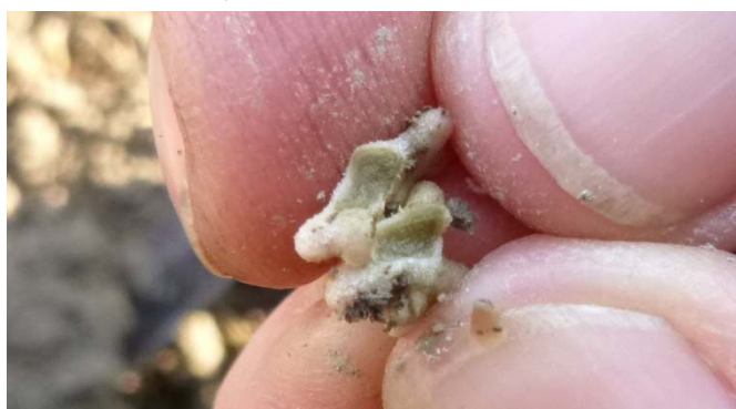
Older, more senescent and inactive nodules with grey colour, on Hungarian vetch ( Vicia pannonica ).