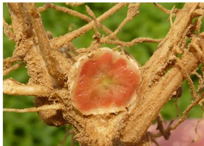
Nodules on soybeans with active (red colour) bacteria ( Bradyrhizobium ).

Grasses grown in mixture with forage legumes can use up to 80 % of the nitrogen from the N fixation in the legumes. In grazed white clover pasture, a fixation rate of 55 to 295 kg N per ha and year was recorded above ground (4) .