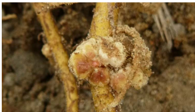
Active, red coloured nodule on lupin ( Lupinus ).