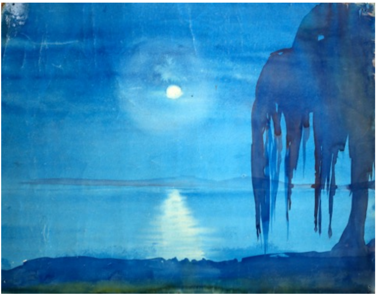
Figure 12. Moonlight Lake.