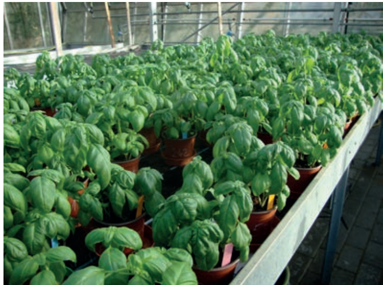
Figure 4.21 Basil grown in pots, on the greenhouse floor (left) or on benches (right).