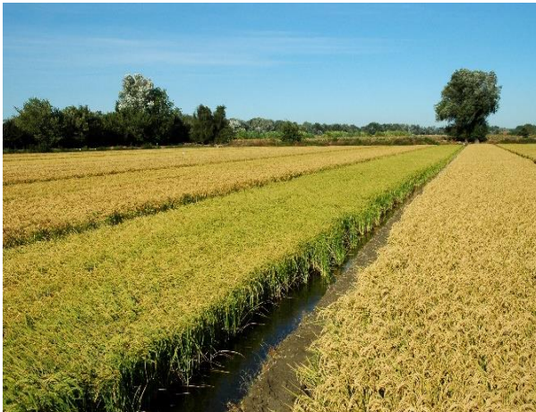
Paddy field in the Camargue

→ Find the complete case study report at www.impresa-project.eu