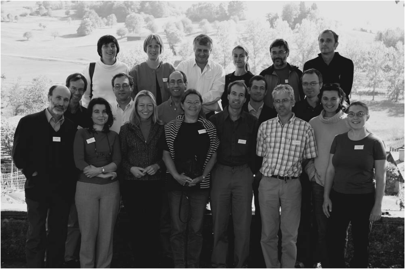
Participants of the workshop held September 25–26, 2003