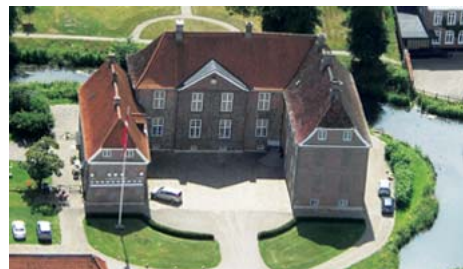
Gram Slot main building

In order to actualize this vision the owners of Gram Slot have engaged in a number of activities reaching beyond a mere agricultural production. These activities constitute the leisure branch of the castle, which generates approximately one third of the overall turnover. Related to the vision of re-creating the castle as a local power center is the ideal of organic farming. Gram Slot is the largest organic dairy farm in Denmark with 1300 hectares together with 350 dairy cows, and thereby serves as an example that organic farming can be done successfully on a large scale in Denmark.