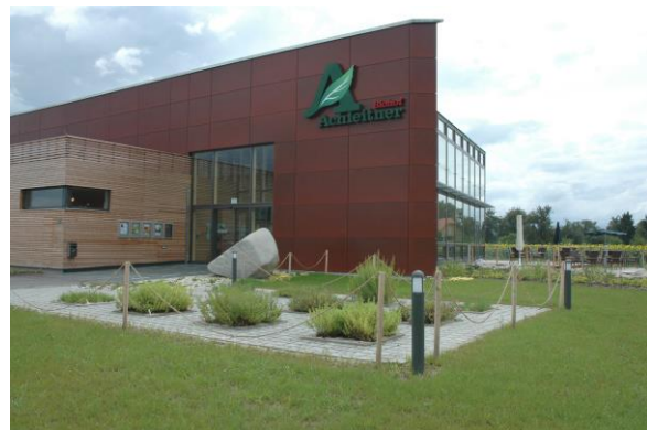
The outlet and distribution premises in Eferding, Upper Austria, opened in 2005