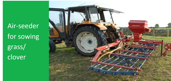
Air-seeder for sowing grass/clover

After the silage is removed, the soil can be tilled with power machinery. Ideally the seeds should be broadcast rather than drilled so as not to bury the small clover seed too much.