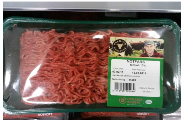
Upplandsbondens package labelling.

The cooperative was selected for study because (1) while the organic food market is growing in Sweden, mid-scale initiatives such as UB are still very rare, as is the development of a regional brand, since the vast majority of (organic) food is sold via three major national level retail chains; (2) UB experiences significant obstacles reaching consumers with its brand, and (3) there is great potential for mid-scale initiatives such as UB in the Stockholm metropolitan area that will be interesting to follow.