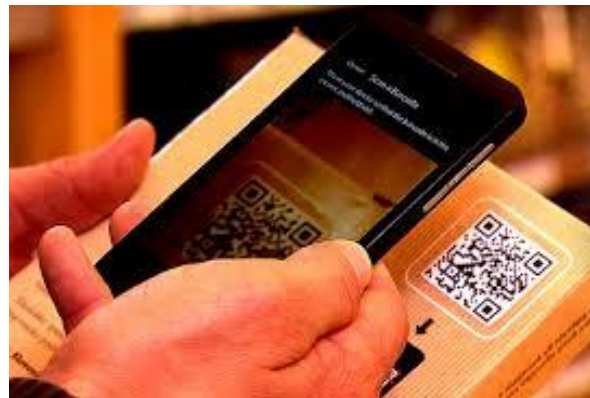
Using a smart phone to scan the QR code on the packaging to get information about producers.

The “Ekodar” organic beef label was established in 2009 by the Šaleška Valley agricultural cooperative. Currently, 76 producers/farmers label their products with the Ekodar brand, which speaks to a connection of trust between producers and consumers. The meat is available in eleven large retailers, such as Mercator, two organic shops, two agricultural co’ops, as well as online, and delivery is available in twelve cities throughout Slovenia. Marketing and distribution is done via the central umbrella of the Šaleška Valley (owner of the brand) agricultural cooperative. The special characteristic