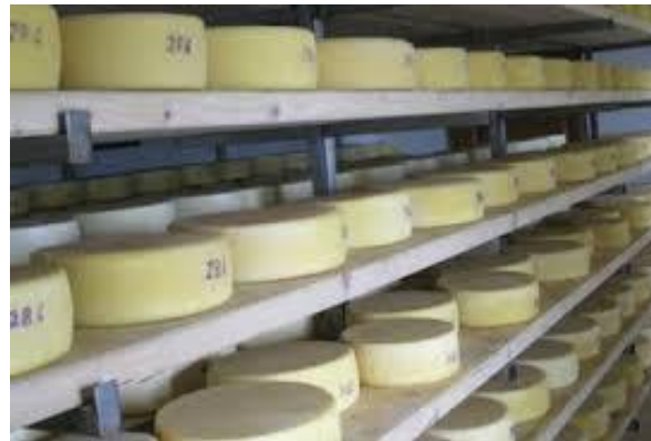
Ripening cellar of Planika dairy located in west-north part of Slovenia.

The company currently sells 19 different milk products under the Planika brand. These high-quality products are characterized by their freshness, taste, and the avoidance of genetic technologies and chemicals/synthetic pesticides. In April of 2013, the dairy began selling organic milk, and it has adhered to an organic quality control system ever since. The "Planika" brand speaks of a traditional way of processing dairy that promotes alpine pastures, of which the company's dairy museum attests to. The enterprise is a cooperative limited company, with a managing director who is authorized to represent the enterprise and to sign documents. Today, the company has 52 employees and 3 facilities. One of the important values of all stakeholders is to ensure the high quality of dairy products made with high-quality, raw milk, which in turn adds to the trust of consumers in their relationship with the brand and