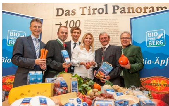
Representatives of Agrarmarketing Tyrol (AMT), Chamber of Agriculture, MPreis, the federal government and Bio vom Berg at the cooperatives' 10 th anniversary.

For instance, the product range has increased from initially 8 products (two meat products and six dairy products) to approximately 130 today and turnover has risen from 672,000 euros in 2003 to 6.3 million in 2014. As far as we know, Bio vom Berg is the only producer-owned brand in Europe which offers a full range of organic products in a supermarket chain. The main objective of BioAlpin is to sustain and facilitate organic and regional small-scale mountain farming by providing farmers with processing facilities and market access. In this respect the cooperative acts as a kind of mediator between farmers, processors and retailers. It coordinates production, negotiates prices and quantities with the retailer partners and organizes logistics. To simplify processes the cooperative organizes and coordinates individual farmers within producer groups. This helps to