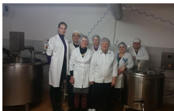
Milk processing staff with the administrative manager of the cooperative 'EKO Žemaitija'

They produced 14 kinds of dairy products: pasteurized milk, sour cream, butter, natural yogurt, kefir, curd, "Kastinys" (a Samogitian ancient dish made of sour cream, sour milk and butter with seasonings that tastes like butter or rich sour cream with seasonings) and different kinds of cottage cheeses. These dairy products are produced from the best quality organic raw milk and do not contain any preservatives, so they are always fresh and healthy. Cottage cheeses are handmade according to the ancient grandmothers' recipes. The cooperative's future dream is to achieve the status of Lithuanian culinary heritage for some kinds of dairy products. Milk and dairy products produced at the cooperative are fully organic, certified by the national certification body 'Ekoagros'.