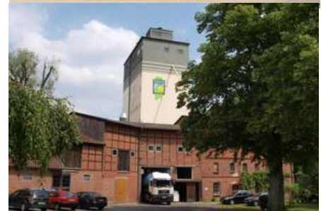
Bohlsener Mühle: main office building and mill facilities ( www.bohlsener-muehle.de )