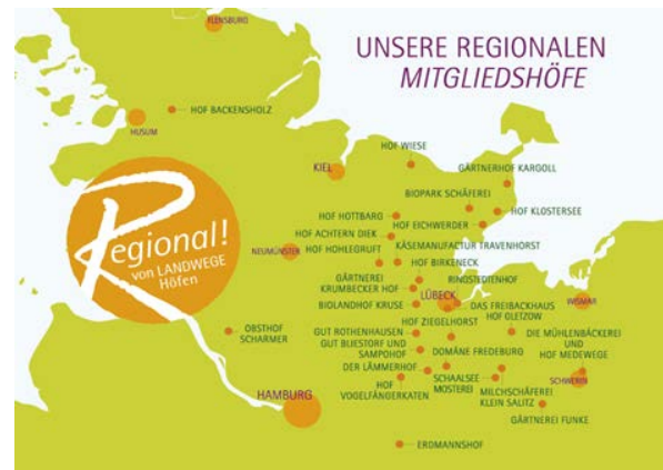
Regional! From Landwege member farms located in Lübeck area

EVG Landwege e.G. is a producer-consumer-cooperative. It was created in a garage in 1988 and has grown into a retail business with five supermarkets, 600 consumer members and 30 organic farm members in the area around Lübeck, northern Germany. The short chain from producer to customer ensures a close connection between the two groups. Landwege has developed into a professional business, and avoided the trap of being too conventional. Significant problems have been solved during the company's development over the last 25 years through 'learning by doing' with support from diverse partners and experts.