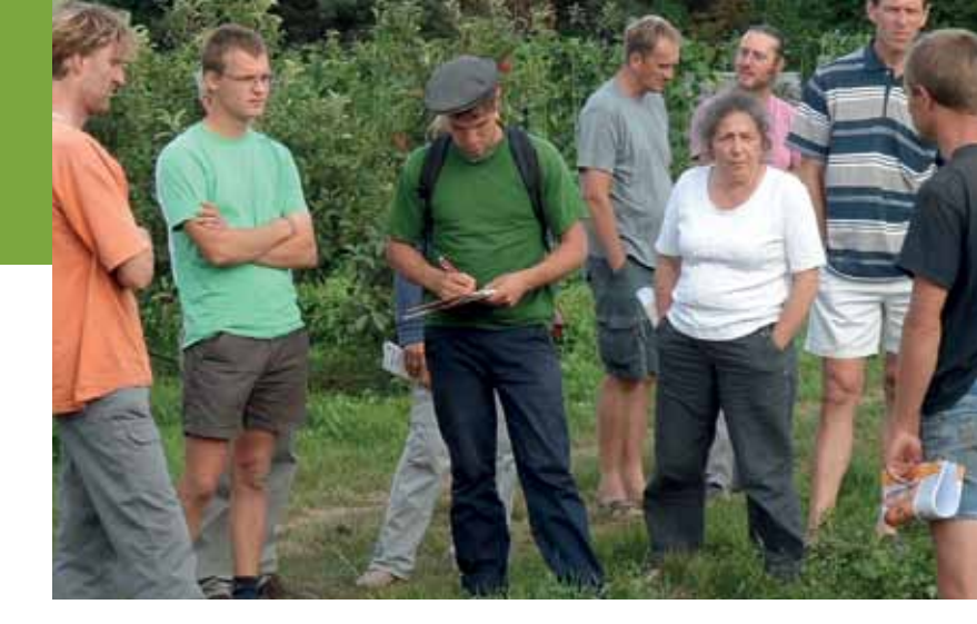
Biobedrijfsnetwerken An initiative of BioForum, Landwiizer and Louis Bolkinstituut

We are now collaborating more frequently across the boundaries of different sectors (e.g., deliberation between livestock farms and farms with crop production for the exchange of feed and manure). Within the sectors, collaboration is happening in specific thematic groups (e.g. in the vegetable sector: short-chain, moderate vegetable crops, own seed production, etc.).