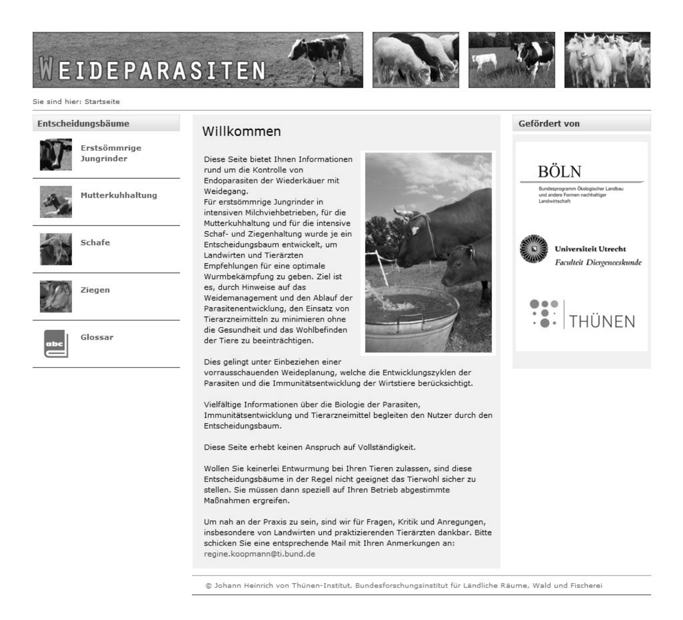
Figure 1: Screenshot of the home site of www.weide-parasiten.de

Questions about the pasturage of ruminants (capital letters in the navigation scheme), that need to be answered with Yes / No, make you navigate through the decision tree. After passing through the navigation scheme you will end up at one recommendation (digits in the navigation scheme), which initially has the safety of the animals in focus (see Figure 2).