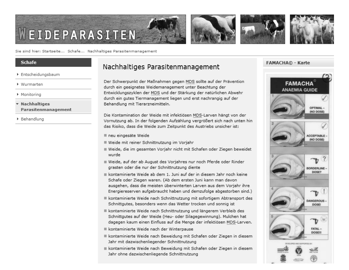
Figure 3: Screenshot with information about sustainable parasite control

The project was funded by the German Federal Agency for Agriculture and Food, Federal Organic Farming scheme.