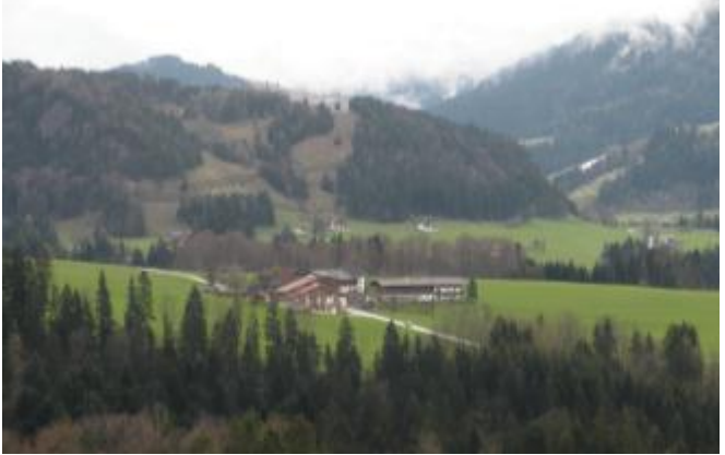
Austrian mountain dairy farm

Stocking rate of the forage area was highest for the UK and Denmark and lowest for Austria and Finland. The majority of the Finnish and Austrian herds only grazed during the day, and three Finnish farms had a grazing season of less than six months, whereas for all other farms in the study the grazing season was six months or more.