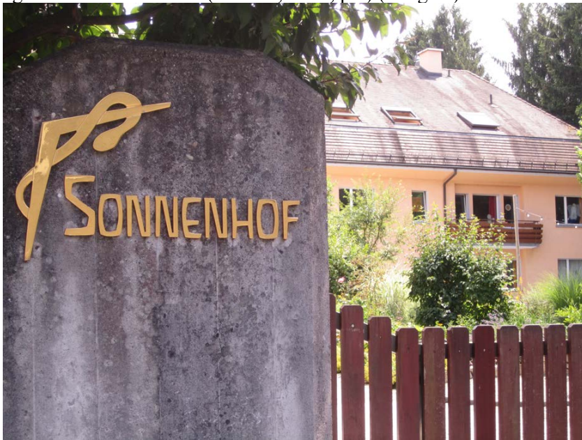
Image 4: Sonnenhof at Arlesheim, site of the earliest BD preparations.