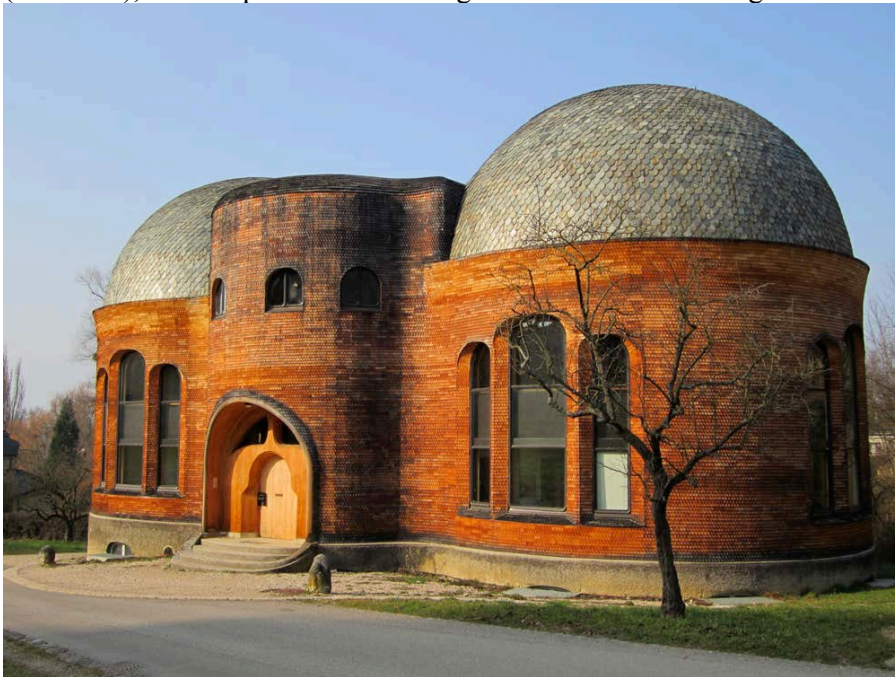
Image 1: The Glass House (1914) at Dornach, Switzerland, designed by Rudolf Steiner

The Glass House (1914) is the oldest extant building designed by Rudolf Steiner. The building is intimately associated with the development of biodynamic agriculture - but that is not why it is called the 'Glass House' (Glashaus), and the pursuit of a new agriculture was not its original use.