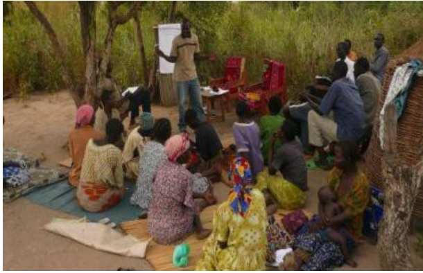
(a) Farmer group in a training session