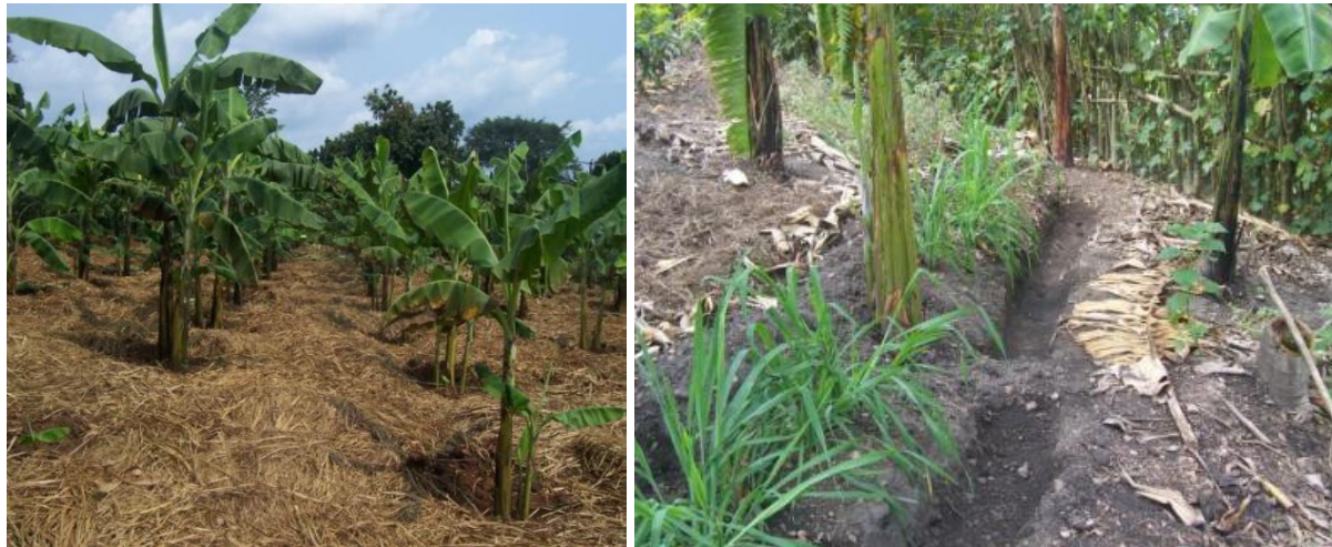
(a) Mulching to improve soil fertility

Figure 2.2 below is cited from Western Uganda where Organic farming has shown a high degree of success.