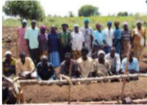
(b) Farmer group in a demonstration plot