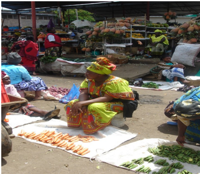
Figure 4.0: Surplus production on local market for household income Source: From Kleedal (2012)

Besides the high organic productivity level that ensures food availability for domestic consumption, the food surpluses can be sold at the local markets from which the communities can boost their household incomes, and develop their purchasing power to enrich their diet and obtain other household necessities (Figure 3). In addition, organic farming ensures availability of fresh organic products to more people in the wider community in all seasons, thus maintaining stable food supply to the population and constant local income generation. For instance, the production of vegetables can proceed year-in year-out even with limited rainfall through irrigation, that ensures household food security and constant cash flow. Also worth-mentioning is that, organic farming and social capital contribute to the promotion of other asset accumulation such as human capital, natural capital, physical and financial capital that helps to correct market failures, reduction of inequalities and fostering social cohesion (Longley et al., 2007). This implies the ability to access wide-range of goods and services for livelihood improvement in the community.