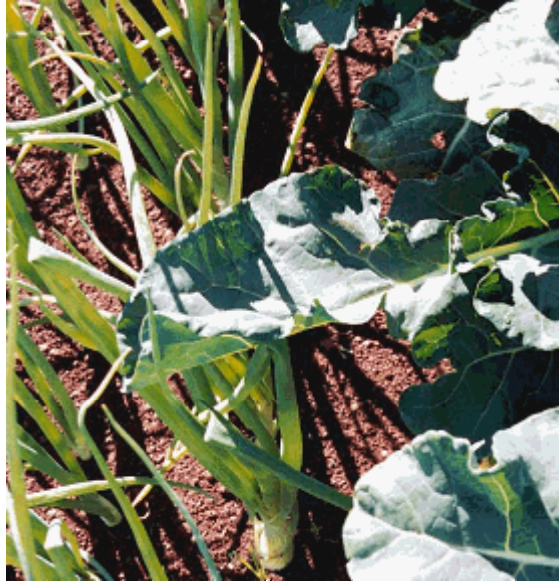
Interface between broccoli and onion. From Broad et al., 2004