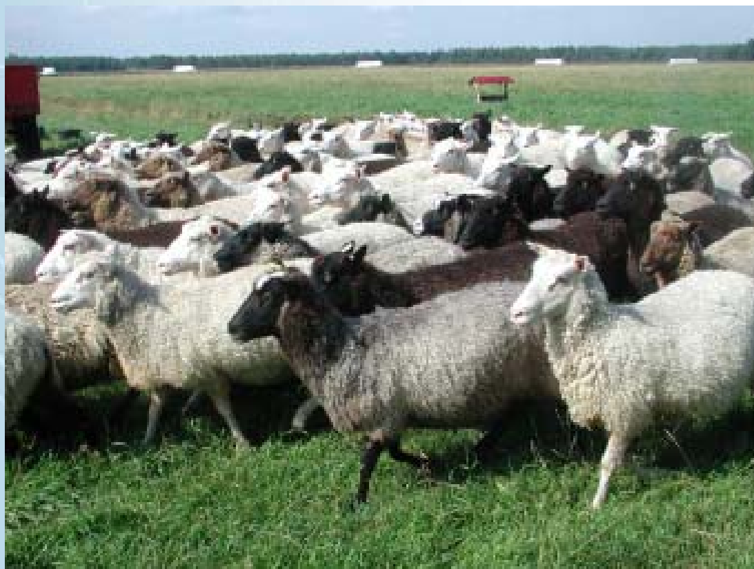
Figure 2. Finnsheep grazing.

The demographic trends in the Finnsheep breed in terms of the status of inbreeding, effective population size, and coefficients of relationships between individuals have been explored. The study showed that average inbreeding