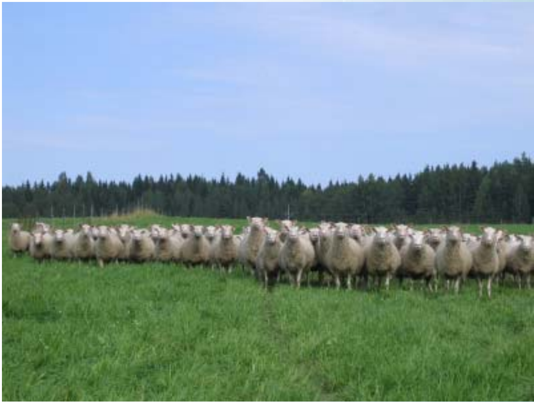
Figure 1. A flock of Finnsheep.

Finnsheep and several mtDNA haplotypes in the group A may have been "imported" to Northern Europe from the East. In addition, the Y-chromosome data suggest that the Finnsheep breed displays haplotypes which are not common in other European sheep breeds