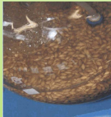
Figure 2 Steeping of grain

A preliminary study was performed in which grains of wheat, rye, and barley were germinated using traditional methods applied in malting for beer production. During malting the amylase enzymes present in the grain are activated (autoamylolytic effect, Rau et al. 1993).