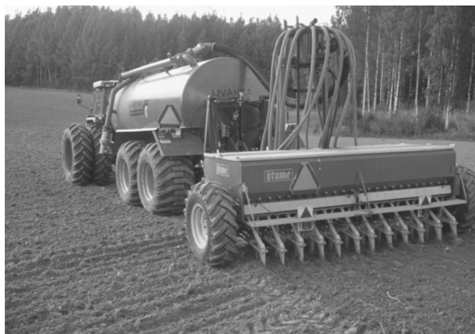
Figure 1. Tanker and drill combination used to apply slurry, mineral fertilizer and seeds.

Gas fluxes were measured for five months after fertilization with a closed chamber method by using rectangular aluminum chambers (60 cm by 60 cm). Gas samples (20 ml) were taken from the top of the chamber by using syringe, transferred immediately to pre-evacuated glass vials and analysed with a gas chromatograph. The method has been described in details by Regina et al. (2004). The effects of different treatments on crop yield and quality are reported by Kapuinen & Tyynelä (2002).