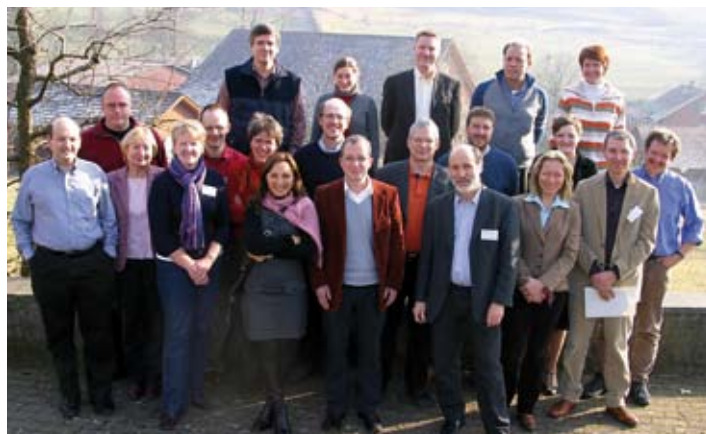
Fig 1. The ORGAP project team – meeting in Frick (Switzerland)

The European Commission released in June 2004 the European Action Plan for Organic Food and Farming (EUOAP). In May 2005 the 3-year, EU funded research project ORGAP ("Evaluation of the European Action Plan for Organic Food and Farming") started with 10 partners from 9 countries (CH, UK, DE, IT, DK, SI, CZ, NL, ES) and IFOAM EU Group.